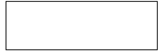
Underside back of wedge